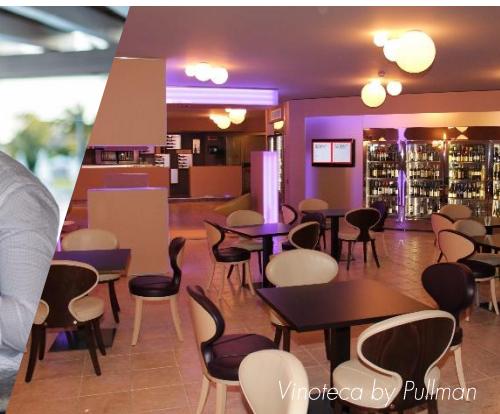
Vinoteca by Pullman