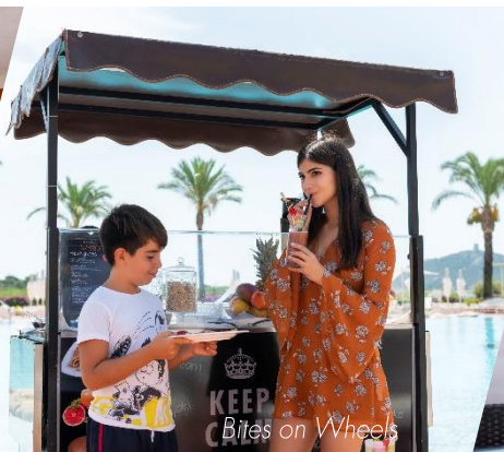
Bites on Wheels