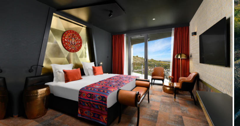
1. Superior Room with Double Bed