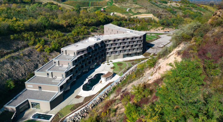
2. Minaro Hotel Tokaj MGallery

Experience MGallery's exceptional mixology when you visit Bar Viracocha. Enjoy a cocktail inspired by the indispensable grape ingredient, with options ranging from Tequila to signature American rum for an exclusive, luxurious experience. Don't miss out on ordering local Tokaj wine, including options from the region's limited series.